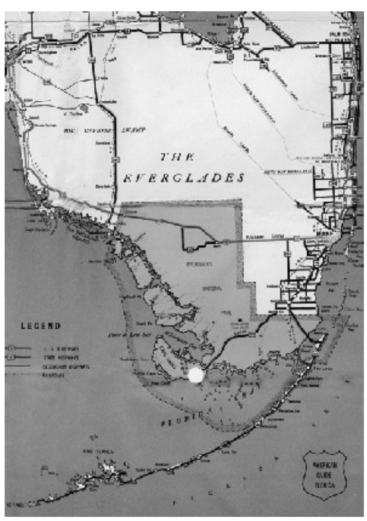
Figure 5. A 1939 map of Florida with Flamingo site indicated at southern tip of state.

Established in the 1880s, Flamingo is historically the largest developed area in Everglades National park. The site is at the southernmost tip of the Florida Peninsula and was historically a tiny village of steadfast residents who made charcoal, fished, hunted birds for plumage and sold these commodities to residents of Key West.<sup>6</sup> This remote area was left undisturbed by most of the outside world until 1934 when the United States Congress authorized Harry S. Truman to dedicate it as a National Park in 1947.