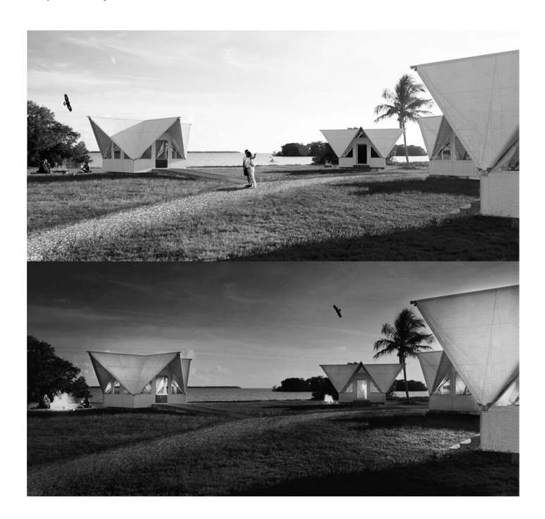
Figure 8. Eco-tents by day (top), and night (bottom).

6. The semester long project definitely pushes the aesthetic/value questions of hand-made versus off-the-shelf. One often simultaneously hears the whispers of Ruskin in one ear and Neutra in the other. These two conflicting positions (hand- made pieces versus selecting mass produced components) are often difficult to reconcile. Experience shows that when at all possible listen to Ruskin - production may slow down but students get so much more from the experience. In an increasingly disengaged world, facilitated by technology, Design/Build is invaluable in re-sensitizing students to a tactile process, each other, the public, the discipline, and most importantly - their own hands.