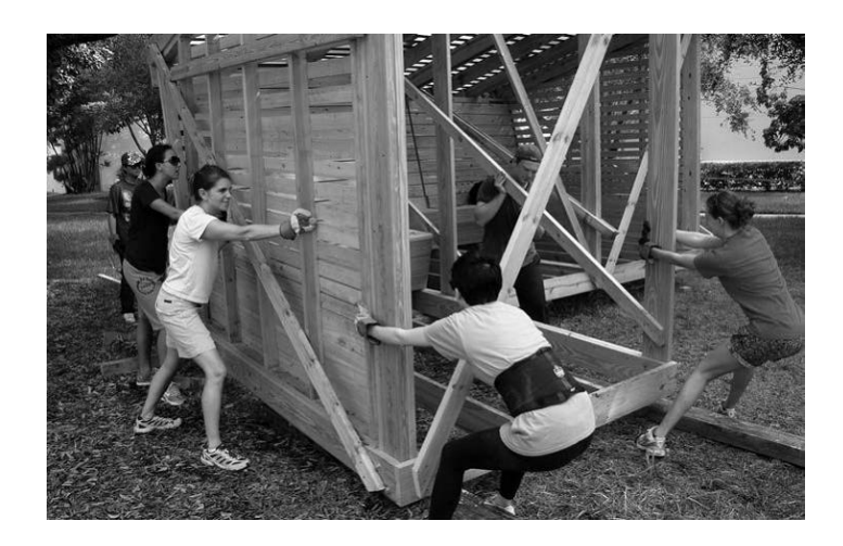
Figure 2. Students using oranges to move a module for transport.

building with a story about Cuba. He said: "When living in Cuba one quickly learns to make-do with what one has on hand," adding "when we needed to move something really heavy and we had no equipment to do the job - we used oranges." So after listening to what sounded like "tall tales" students cut a dozen or so oranges, ate the interior of the oranges