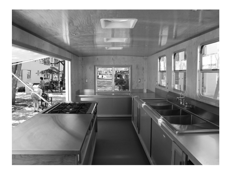
Figure 4. Interior of mobile organic kitchen.

do the work as you think you need. Lesson 2: Any project that is systems intensive requires greater coordination and onsite modification for things to go together quickly. Lesson 3: Reusing existing components while saving upfront costs often adds time for recycling, researching compatible parts, refinishing and reconditioning existing parts to finally have functional pieces. These additional time outlays must be computed into the cost of the final piece. The final project is quite well crafted, unique, and made from a substantial amount of salvaged material. Its impact on the community it is intended to serve will show with time.