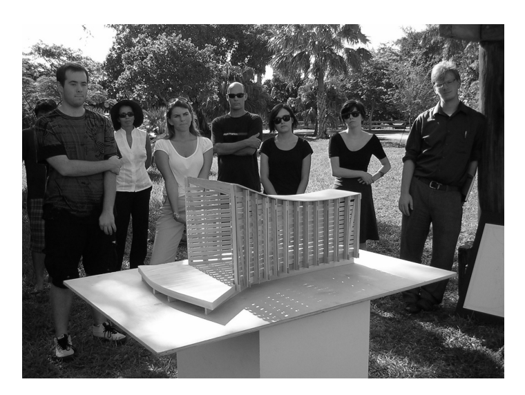
Figure 1. Tired students say goodbye to an innovative design for Crandon Park.

The controversy was born out of an unforeseen review process that ultimately deemed the design inconsistent with the new park master plan. The master plan, under review at the time was the subject