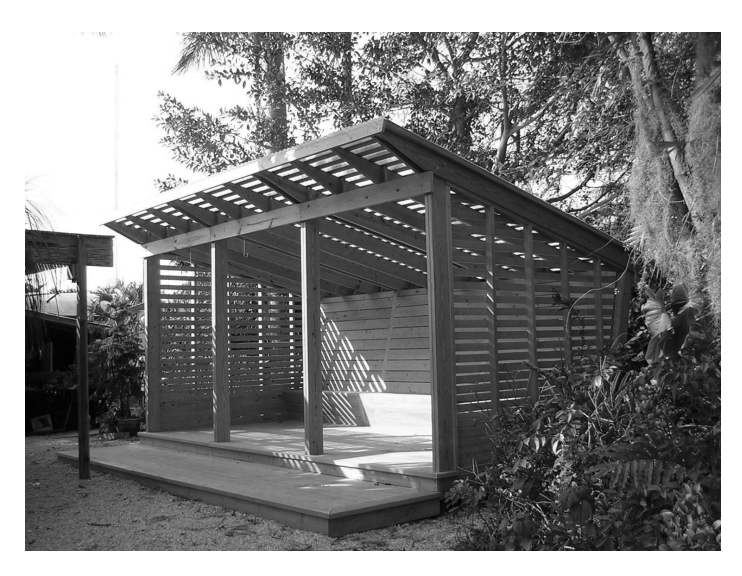
Figure 3. Finished Orchid Sales-display pavilion.

(because it was hot) and put the pulp side down between the wood skids and joists that support the 1700 lb. module. To everyone's amazement, the leftover pulp and fleshy consistency of the skin, stayed together long enough to slide the heavy modules along the skids with very little effort. This tool/technique, underscored the value of ingenuity and resourcefulness for solving a problem on the spot. With the addition of a cable winch hoist, car jack and steel bars, students lowered the modules onto the trailer and ultimately transported all three modules to the site.<sup>2</sup> Today the finished building is well liked and has become the front porch to the nursery.